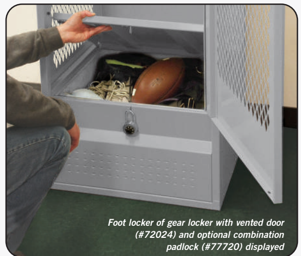
Foot locker of gear locker with vented door (#72024) and optional combination padlock (#77720) displayed

Note: Built-in locks are pre-installed on assembled lockers.